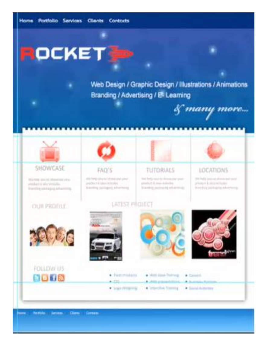
Web Layout Design

Outputs: Web Layout Design, Web Banner, Advertisement, UI Design